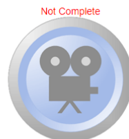
Watch the Orientation Video