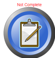
Enter Your Provider Information